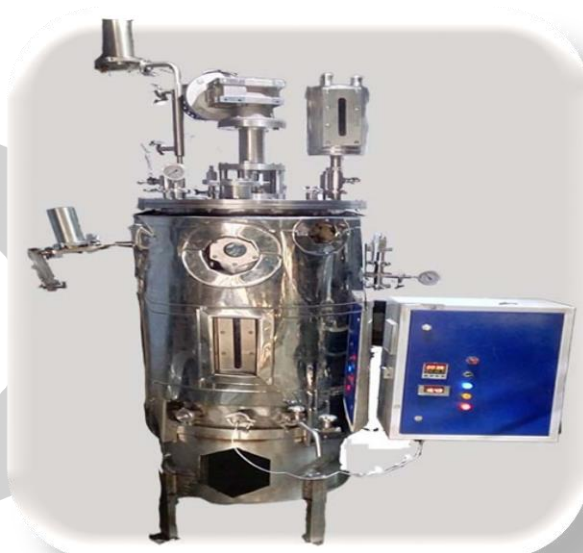
Production Scale SS Fermenter