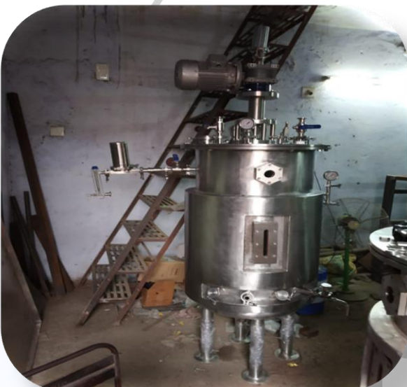
Pilot Scale Fermenter