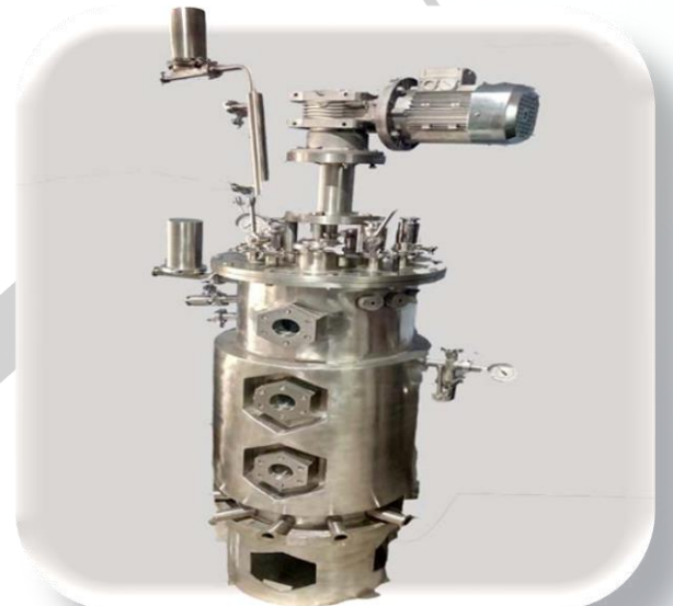
Pilot Scale Fermenter