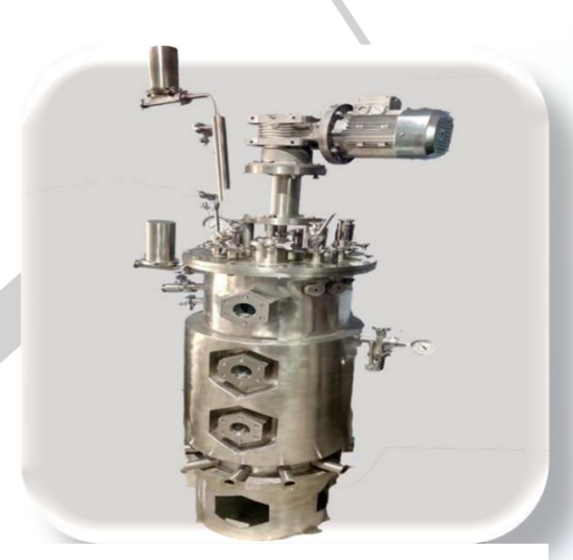
Pilot Scale Fermenter