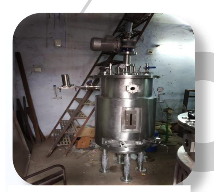
Pilot Scale Fermenter