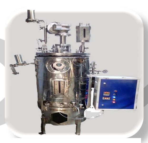
Production Scale SS Fermenter